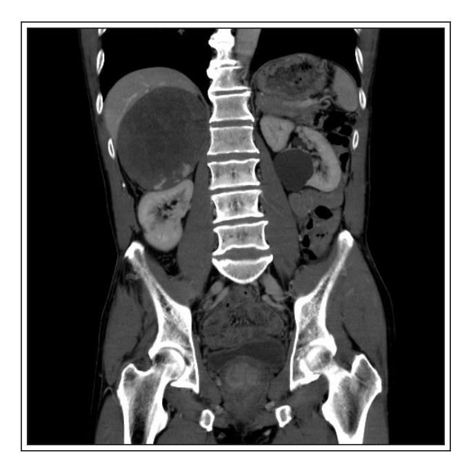
Figure 1. Coronal CT scan showing a large heterogenous RUQ mass ablating the liver and renal upper pole.

non-contributory to the tumor. In fact, the vascular supply of the tumor originated exclusively from a branch off the right renal artery, suggesting the mass was adrenal in origin, Figure 2. The planned