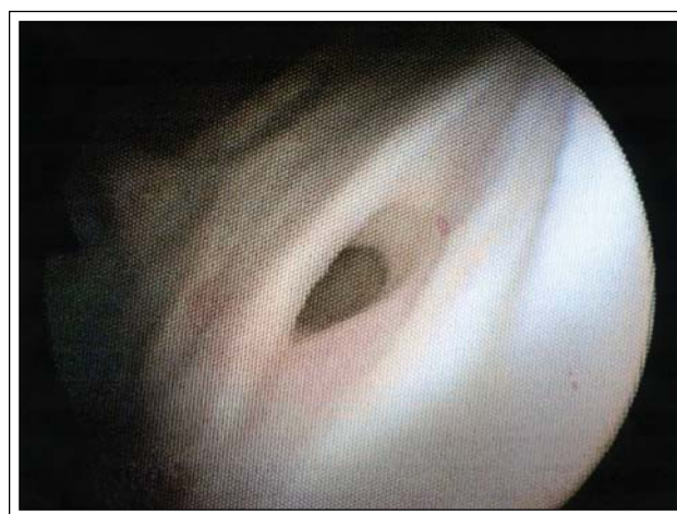
Figure 3. Appearance of resected left ureter on follow-up cystoscopy. Cystoscopic appearance of left ureter orifice during repeat biopsy. Note open appearance consistent with vesicoureteral reflux.

The sixth course of BCG was not administered. Repeat bladder biopsies 3 months following BCG completion were negative for carcinoma. Cystoscopic evaluation of the resected left ureteral orifice acquired during the repeat bladder biopsy is present in Figure 3. The patient is without bladder tumor recurrence for over 1 year.