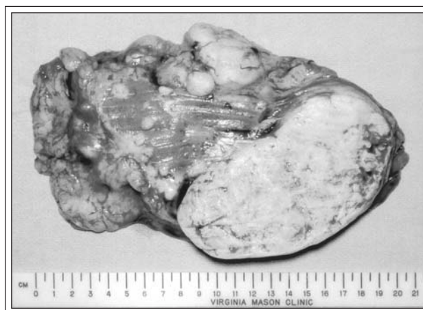
Figure 2. Gross specimen of the right kidney with multiple nodules.

These lesions are uncommon and in general have a benign course although some authors regard this as a low grade Sarcoma. 2 In addition, a small focus of clear cell adenocarcinoma (Grade I/IV) was located adjacent to the PEComa. For these reasons, this patient is being followed closely with serial CT scans of her abdomen and pelvis every 6 months for the past 3 years. There has been no interval growth of the renal masses in the contralateral kidney. The patient's renal function remains stable with a creatinine of 1.2 mg/dl.