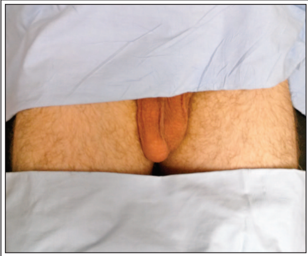
Figure 1. Male patient lying supine and draped prior to the scrotal exam.

left epididymis, the thumbs line up with the median raphe and the middle fingers line up with the lateral border of the scrotum.