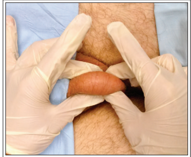
Figure 3. Final hand position demonstrating the epididymis fixed between the middle fingers and thumbs for easy palpation.

of the epididymis allows systematic examination of the epididymal head, body and tail. Additionally, this maneuver results in a testicle that protrudes upwards and through the 'frame' for easy digital palpation.