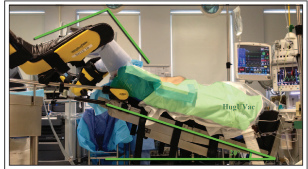
Figure 1. Patient positioning for robot assisted radical prostatectomy. The patient is placed on steep (20 degrees) Trendelenburg position and then secured with the Allen's Hug-u-Vac steep trend positioner (Allen Medical Systems, Acton, MA, USA ( http://www.allenmedical.com/uploads/files/pdf/D-770599_A1_Allen_Hug-u-Vac_Steep_Trend_Slicksheet_NP.pdf ))

Only after this preparation has been completed, is the patient put in Trendelenburg position at an inclination of 20-25 degrees to facilitate exposure of the pelvic content. Studies have shown that patients undergoing this procedure in a steep Trendelenburg position for 3h-4h do not present significant cerebrovascular, respiratory or hemodynamic problems. However, caution is advised for longer operative time, in particular for patients with glaucoma, as prolonged trendelenburg position can increase intra-ocular pressure.