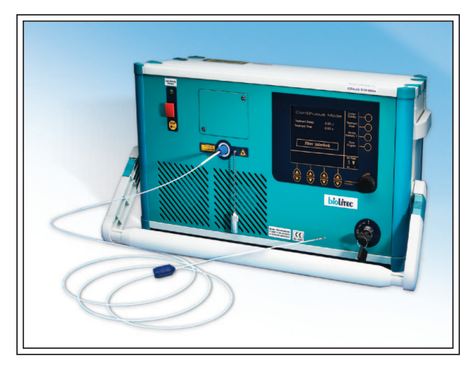
Figure 1. The Evolve Dual Laser System. This 980 nm/ 1470 nm laser system is highly portable, weighing < 78 pounds and using conventional power supplies (110V, 60 Hz); uses up to 200W of power, and offers both continuous or pulsed laser emission.

The Evolve Dual (980 nm/1470 nm) laser system, Figure 1, was set at 150W in continuous mode, with up to 200W of available energy, giving the physician the flexibility to increase or decrease the energy based on surgical needs. The energy can be changed at 1W or 5W increments any time the laser is not firing.