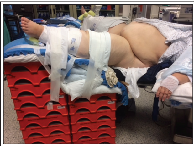
Figure 3. Side profile of modified dorsal lithotomy positioning. Ergo-step stools stacked in graduated fashion for ergonomic leg positioning in modified dorsal lithotomy positioning. For desired slope, 9 stools were stacked under each foot and 6 under each thigh. Pillows and foam rolls were used for pressure point padding and fine tunings. Legs were secured to leg supports with 2 inch silk tape.

designated to give direction to the team. It is helpful to first go over a game plan prior to execution in this situation. Taking time to do it in a stepwise manner will ensure it is done safely. Patient was positioned