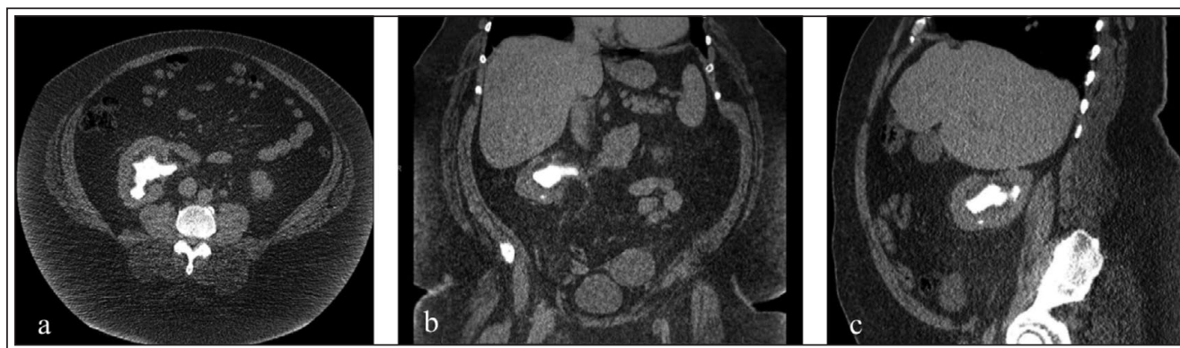
Figure 1. Super obese patient (BMI 85) with large volume right-sided stone a) axial b) coronal and c) sagittal images from CT abdomen and pelvis demonstrating right staghorn calculus.

It was necessary to have additional personnel for positioning the patient, typically 12 including four on each side, one for each leg and two anesthesia providers at the head. When transferring the patient to the surgical bed it is important to have one person