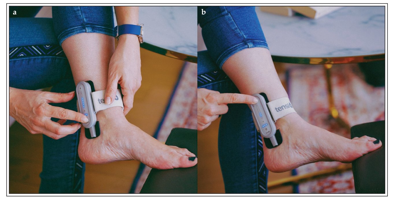
Figure 4. a) Press and hold down the ON/OFF buttom. b) Press the (+) buttom, this will activate the program.