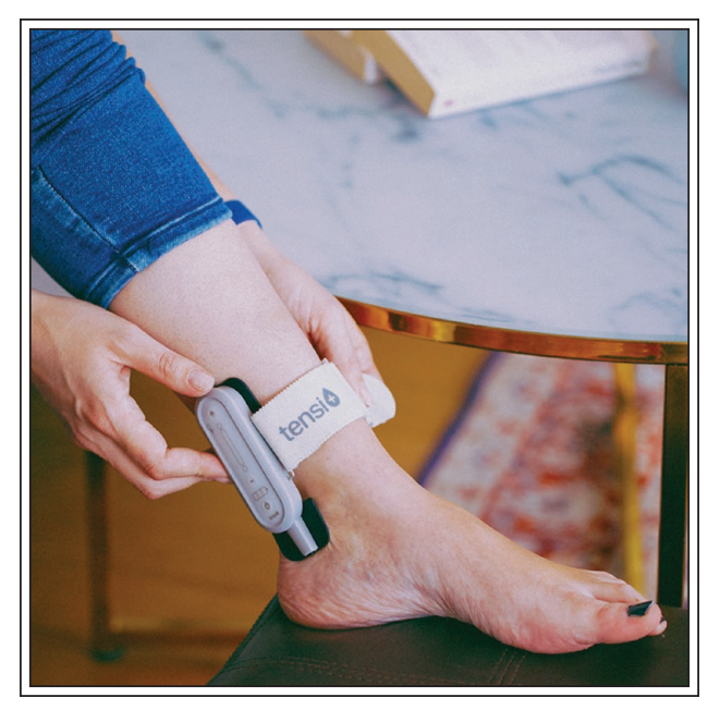
Figure 3. TENSI+ should be placed over the ankle with the lower electrode placed below and behind the medial malleolus.